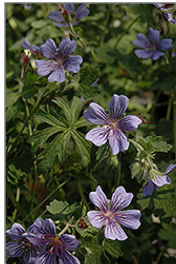
Brookside Cranesbill flowers

This is a relatively low maintenance plant, and should only be pruned after flowering to avoid removing any of the current season's flowers. Deer don't particularly care for this plant and will usually leave it alone in favor of tastier treats. It has no significant negative characteristics.