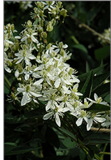
Ground Clematis flowers

Ground Clematis will grow to be about 3 feet tall at maturity, with a spread of 3 feet. It grows at a fast rate, and under ideal conditions can be expected to live for approximately 10 years.