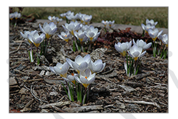
Blue Pearl Crocus in bloom

Blue Pearl Crocus is recommended for the following landscape applications;