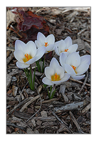
Blue Pearl Crocus flowers

This is a relatively low maintenance plant, and should never be pruned except to remove any dieback, as it tends not to take pruning well. It has no significant negative characteristics.