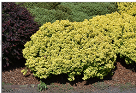
Golden Nugget Japanese Barberry