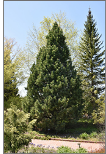
Swiss Stone Pine

Swiss Stone Pine will grow to be about 40 feet tall at maturity, with a spread of 18 feet. It has a low canopy with a typical clearance of 3 feet from the ground, and should not be planted underneath power lines. It grows at a slow rate, and under ideal conditions can be expected to live to a ripe old age of 120 years or more; think of this as a heritage tree for future generations!