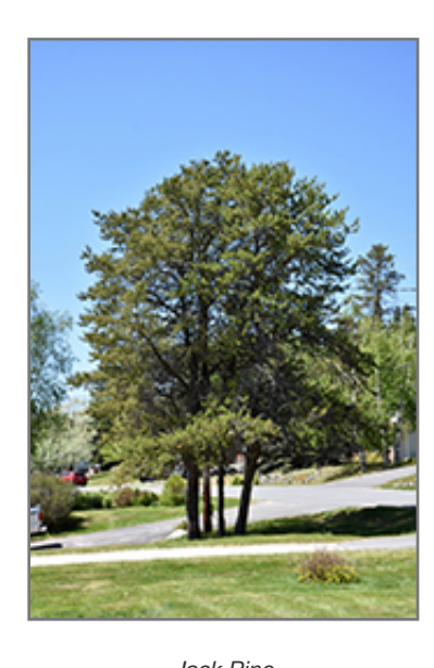
Jack Pine