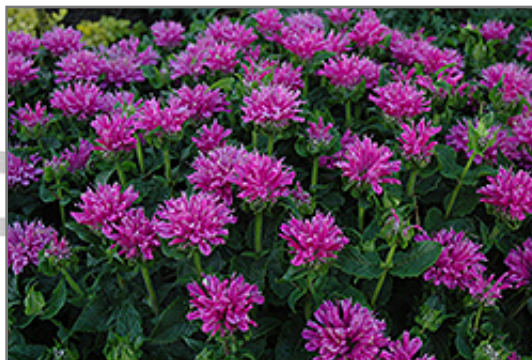
Petite Delight Beebalm flowers