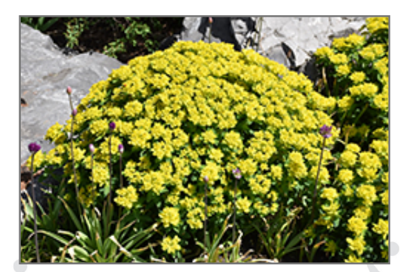
Cushion Spurge in bloom

This is a relatively low maintenance plant, and should only be pruned after flowering to avoid removing any of the current season's flowers. Deer don't particularly care for this plant and will usually leave it alone in favor of tastier treats. Gardeners should be aware of the following characteristic(s) that may warrant special consideration;