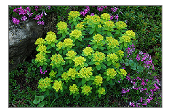
Cushion Spurge in bloom

Cushion Spurge is an herbaceous perennial with a mounded form. Its medium texture blends into the garden, but can always be balanced by a couple of finer or coarser plants for an effective composition.