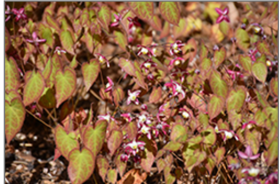
Bishop's Hat in bloom

Bishop's Hat will grow to be about 12 inches tall at maturity, with a spread of 18 inches. When grown in masses or used as a bedding plant, individual plants should be spaced approximately 15 inches apart. Its foliage tends to remain dense right to the ground, not requiring facer plants in front. It grows at a medium rate, and under ideal conditions can be expected to live for approximately 10 years.