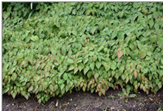
Bishop's Hat