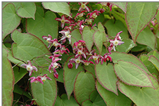
Bishop's Hat flowers

Bishop's Hat is a dense herbaceous evergreen perennial with a ground-hugging habit of growth. Its relatively fine texture sets it apart from other garden plants with less refined foliage.