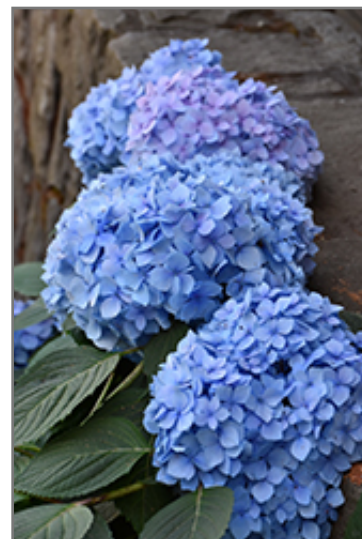
Blue Enchantress Hydrangea flowers

Blue Enchantress Hydrangea is recommended for the following landscape applications;