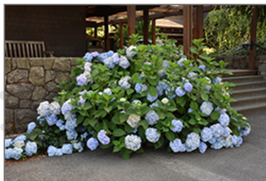
Blue Enchantress Hydrangea in bloom