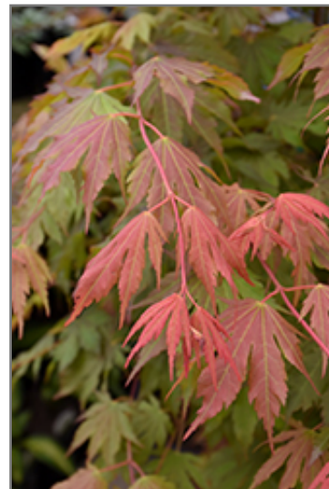
North Wind Japanese Maple foliage