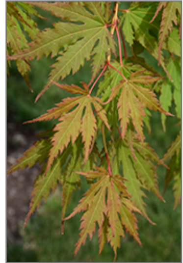
North Wind Japanese Maple foliage

This tree does best in full sun to partial shade. It does best in average to evenly moist conditions, but will not tolerate standing water. It is not particular as to soil type or pH. It is somewhat tolerant of urban pollution. This particular variety is an interspecific hybrid.