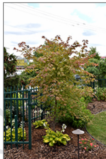
North Wind Japanese Maple