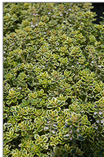
Lemon Thyme foliage

Lemon Thyme is smothered in stunning spikes of lilac purple flowers rising above the foliage from early to late summer. Its attractive tiny fragrant round leaves remain light green in color throughout the year.