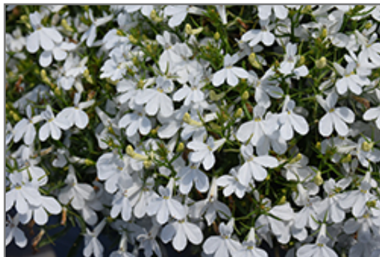
Techno Upright White Lobelia flowers

Techno Upright White Lobelia is recommended for the following landscape applications;