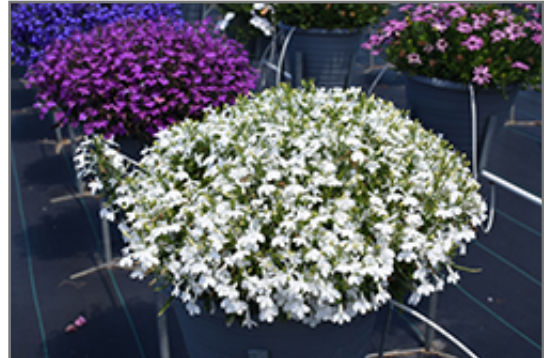
Techno Upright White Lobelia in bloom

Techno Upright White Lobelia will grow to be about 10 inches tall at maturity, with a spread of 12 inches. When grown in masses or used as a bedding plant, individual plants should be spaced approximately 10 inches apart. Its foliage tends to remain low and dense right to the ground. Although it's not a true annual, this fast-growing plant can be expected to behave as an annual in our climate if left outdoors over the winter, usually needing replacement the following year. As such, gardeners should take into consideration that it will perform differently than it would in its native habitat.