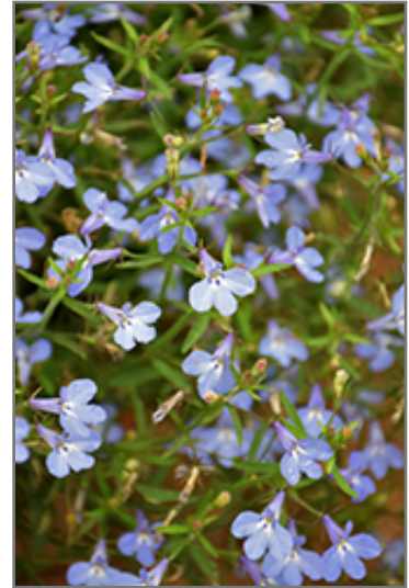
Techno Light Blue Lobelia flowers

Techno Light Blue Lobelia will grow to be about 8 inches tall at maturity, with a spread of 12 inches. When grown in masses or used as a bedding plant, individual plants should be spaced approximately 10 inches apart. Its foliage tends to remain low and dense right to the ground. Although it's not a true annual, this fast-growing plant can be expected to behave as an annual in our climate if left outdoors over the winter, usually needing replacement the following year. As such, gardeners should take into consideration that it will perform differently than it would in its native habitat.