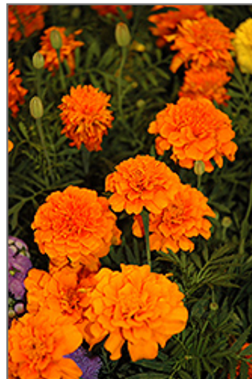
Little Hero Orange Marigold flowers

Little Hero Orange Marigold will grow to be about 10 inches tall at maturity, with a spread of 12 inches. When grown in masses or used as a bedding plant, individual plants should be spaced approximately 10 inches apart. Its foliage tends to remain low and dense right to the ground. This fast-growing annual will normally live for one full growing season, needing replacement the following year.