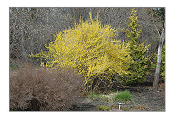
Northern Gold Forsythia in bloom

This shrub is the undisputed harbinger of spring, with prolific yellow flowers smothering the branches in early spring ahead of the leaves, fades into the background the rest of the year; a vigorous cultivar, probably the hardiest variety available