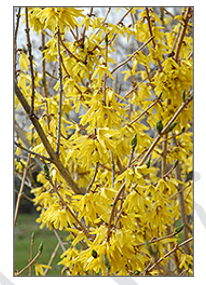
Northern Gold Forsythia flowers

10,000 Great Plains Blvd. Chaska, MN 55318 952-445-6555 www.TheMustardSeedInc.com contactus@themustardseedinc.com ...the birds of the air can perch in its shade. Mark 4:30-32