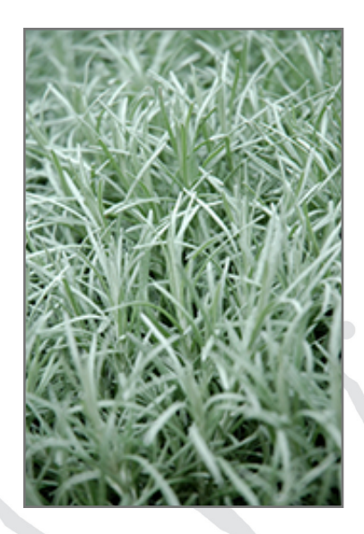
Curry Plant foliage

Curry Plant is recommended for the following landscape applications;