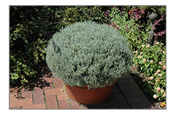
Curry Plant

This is a relatively low maintenance plant, and should only be pruned after flowering to avoid removing any of the current season's flowers. Deer don't particularly care for this plant and will usually leave it alone in favor of tastier treats. It has no significant negative characteristics.