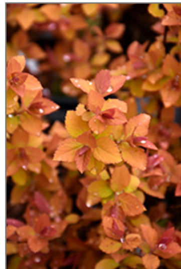
Double Play Big Bang Spirea foliage

This shrub should only be grown in full sunlight. It prefers to grow in average to moist conditions, and shouldn't be allowed to dry out. It is not particular as to soil type or pH. It is highly tolerant of urban pollution and will even thrive in inner city environments. This particular variety is an interspecific hybrid.