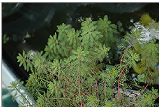
Red Stemmed Parrot Feather foliage