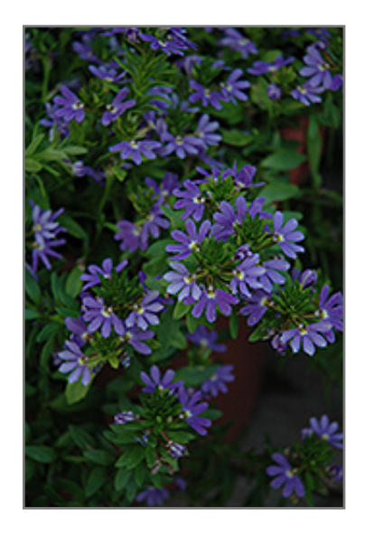
Blue Wind Fan Flower flowers

Blue Wind Fan Flower features dainty royal blue flowers with sky blue overtones along the stems from mid spring to late summer. Its small serrated oval leaves remain dark green in color throughout the season.