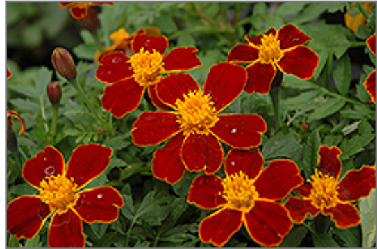
Disco Red Marigold flowers