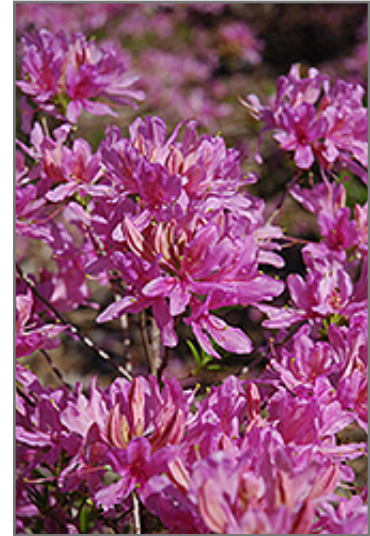
Orchid Lights Azalea flowers

Orchid Lights Azalea is recommended for the following landscape applications;