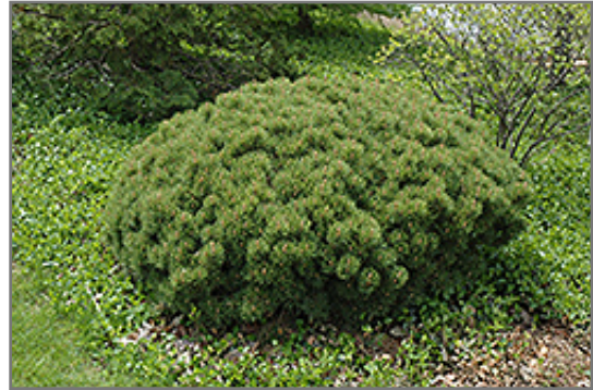
Slowmound Mugo Pine

Other Names: Mugho Pine, Swiss Mountain Pine