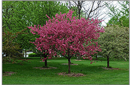
Prairiefire Flowering Crab in bloom

This tree will require occasional maintenance and upkeep, and is best pruned in late winter once the threat of extreme cold has passed. It is a good choice for attracting birds to your yard. It has no significant negative characteristics.