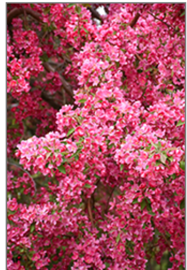
Prairiefire Flowering Crab flowers