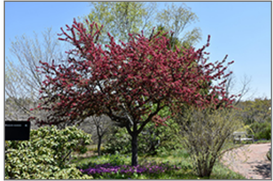
Adams Flowering Crab in bloom

This tree will require occasional maintenance and upkeep, and is best pruned in late winter once the threat of extreme cold has passed. It is a good choice for attracting birds to your yard. It has no significant negative characteristics.