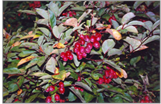
Adams Flowering Crab fruit

This tree should only be grown in full sunlight. It prefers to grow in average to moist conditions, and shouldn't be allowed to dry out. It is not particular as to soil type or pH. It is highly tolerant of urban pollution and will even thrive in inner city environments. This particular variety is an interspecific hybrid.