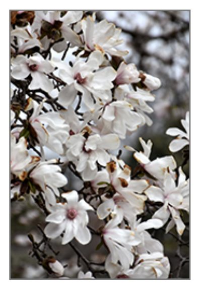
Merrill Magnolia Tree flowers

This tree does best in full sun to partial shade. It requires an evenly moist well-drained soil for optimal growth, but will die in standing water. It is not particular as to soil type, but has a definite preference for acidic soils. It is highly tolerant of urban pollution and will even thrive in inner city environments. Consider applying a thick mulch around the root zone in winter to protect it in exposed locations or colder microclimates. This particular variety is an interspecific hybrid.