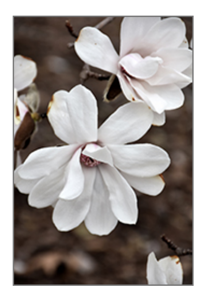
Merrill Magnolia Tree flowers