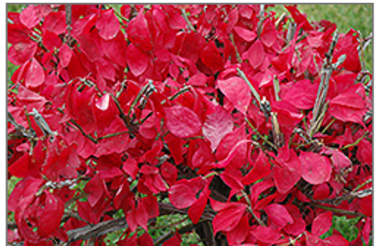
Dwarf Winged Euonymus in fall