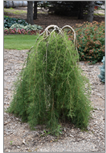
Walker Weeping Caragana

This shrub does best in full sun to partial shade. It prefers dry to average moisture levels with very well-drained soil, and will often die in standing water. It is considered to be drought-tolerant, and thus makes an ideal choice for xeriscaping or the moisture-conserving landscape. It is not particular as to soil type or pH, and is able to handle environmental salt. It is highly tolerant of urban pollution and will even thrive in inner city environments. This is a selected variety of a species not originally from North America.