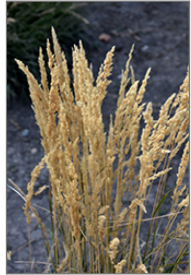
El Dorado Feather Reed Grass fruit

El Dorado Feather Reed Grass is a fine choice for the garden, but it is also a good selection for planting in outdoor pots and containers. Because of its height, it is often used as a 'thriller' in the 'spiller-thriller-filler' container combination; plant it near the center of the pot, surrounded by smaller plants and those that spill over the edges. It is even sizeable enough that it can be grown alone in a suitable container. Note that when growing plants in outdoor containers and baskets, they may require more frequent waterings than they would in the yard or garden. Be aware that in our climate, most plants cannot be expected to survive the winter if left in containers outdoors, and this plant is no exception. Contact our experts for more information on how to protect it over the winter months.