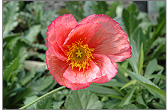
Champagne Bubbles Poppy flowers

This plant does best in full sun to partial shade. It prefers dry to average moisture levels with very well-drained soil, and will often die in standing water. It is not particular as to soil type or pH. It is somewhat tolerant of urban pollution, and will benefit from being planted in a relatively sheltered location. Consider covering it with a thick layer of mulch in winter to protect it in exposed locations or colder microclimates. This is a selection of a native North American species.