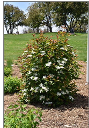
Redwing Viburnum in bloom