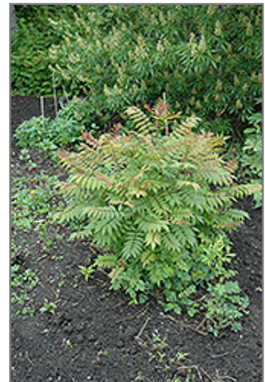
Sem Falsespirea