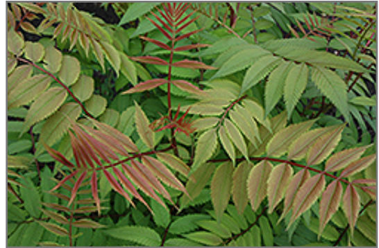
Sem Falsespirea foliage