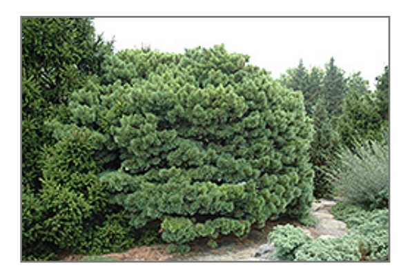
Scotch Dwarf Blue Pompon

Scotch Dwarf Blue Pompon is recommended for the following landscape applications;