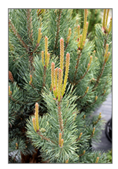
Scotch Dwarf Blue Pompon foliage

Minneapolis, 6010 Lyndale Ave. S. | Maplewood, 2600 White Bear Ave. N. | Apple Valley, 7955 150th St. W. Plymouth, 10050 6th Ave. N. | Eden Prairie, 770 Prairie Center Dr. | Fridley, 8200 University Ave. NE. Bachmans.com