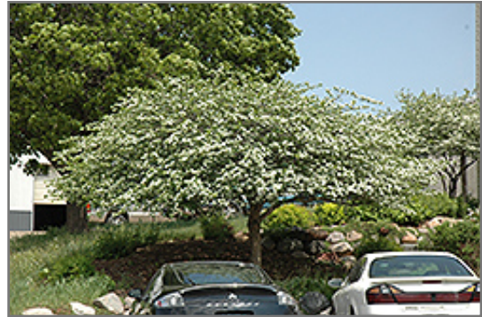
Thornless Hawthorn in bloom