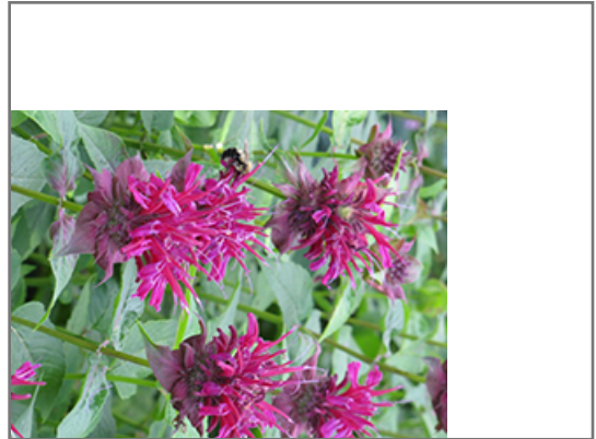
Raspberry Wine Monarda flowers

Raspberry Wine Monarda will grow to be about 30 inches tall at maturity, with a spread of 32 inches. When grown in masses or used as a bedding plant, individual plants should be spaced approximately 28 inches apart. It grows at a fast rate, and under ideal conditions can be expected to live for approximately 5 years. As an herbaceous perennial, this plant will usually die back to the crown each winter, and will regrow from the base each spring. Be careful not to disturb the crown in late winter when it may not be readily seen!