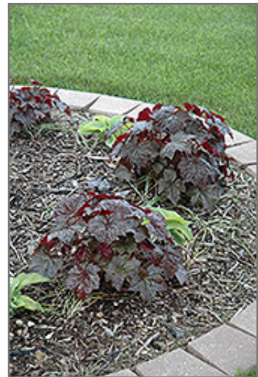
Palace Purple Coral Bells