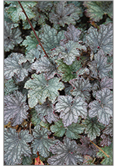
Frosted Violet Coral Bells foliage

This is a relatively low maintenance plant, and should be cut back in late fall in preparation for winter. It is a good choice for attracting hummingbirds to your yard. It has no significant negative characteristics.