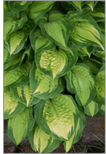
Island Breeze Hosta foliage