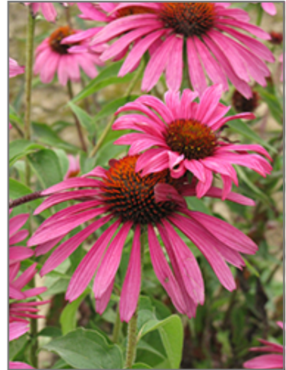
Ruby Star Echinacea flowers