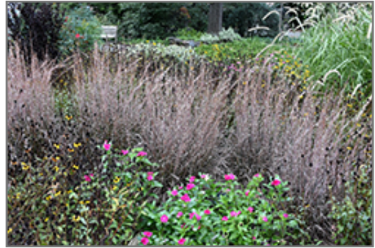
Standing Ovation Bluestem in fall

Standing Ovation Bluestem is recommended for the following landscape applications;