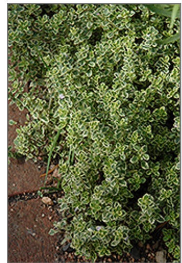
Aureus Lemon Thyme foliage