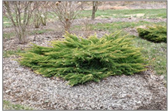
Gold Lace Juniper

This shrub should only be grown in full sunlight. It is very adaptable to both dry and moist growing conditions, but will not tolerate any standing water. It is not particular as to soil type or pH. It is highly tolerant of urban pollution and will even thrive in inner city environments. This particular variety is an interspecific hybrid.