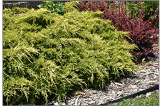
Gold Lace Juniper

This is a high maintenance shrub that will require regular care and upkeep, and is best pruned in late winter once the threat of extreme cold has passed. Deer don't particularly care for this plant and will usually leave it alone in favor of tastier treats. It has no significant negative characteristics.