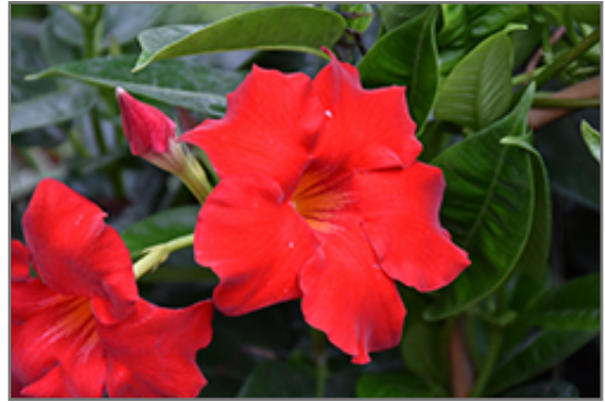
Red Mandevilla flowers

This plant does best in full sun to partial shade. It requires an evenly moist well-drained soil for optimal growth. It is not particular as to soil type or pH. It is highly tolerant of urban pollution and will even thrive in inner city environments. This particular variety is an interspecific hybrid, and parts of it are known to be toxic to humans and animals, so care should be exercised in planting it around children and pets. It can be propagated by cuttings; however, as a cultivated variety, be aware that it may be subject to certain restrictions or prohibitions on propagation.