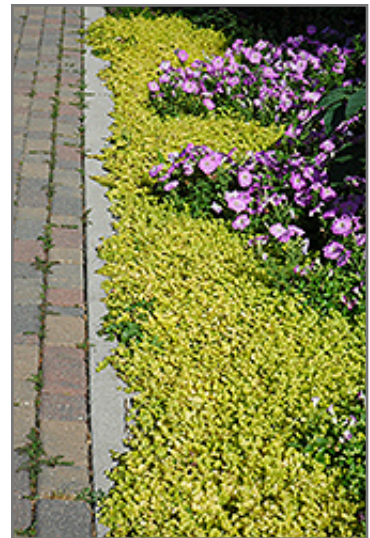
Golden Moneywort