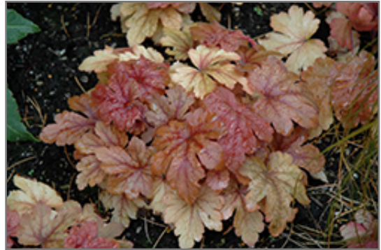
Buttered Rum Foamy Bells

Buttered Rum Foamy Bells is recommended for the following landscape applications;