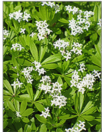
Sweet Woodruff Galium flowers