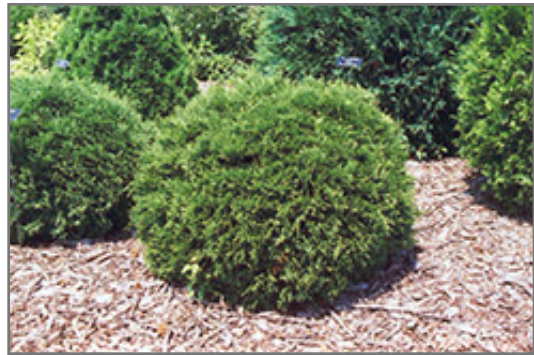
Hetz Midget Arborvitae

A compact, ball-shaped evergreen shrub, very slow growing, excellent for garden detail use and for rock gardens; hardy and adaptable, best with adequate sun, protect from drying winds