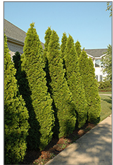
Emerald Arborvitae