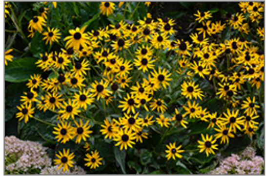
Little Goldstar Rudbeckia in bloom

This is a relatively low maintenance plant, and should be cut back in late fall in preparation for winter. It is a good choice for attracting butterflies to your yard, but is not particularly attractive to deer who tend to leave it alone in favor of tastier treats. It has no significant negative characteristics.