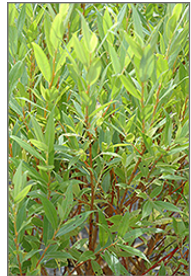
Flame Willow foliage